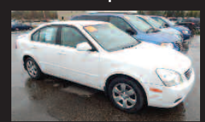
2008 Kia Optima LX