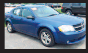
2008 Dodge Avenger SXT