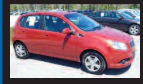
2011 Chevy Aveo 5