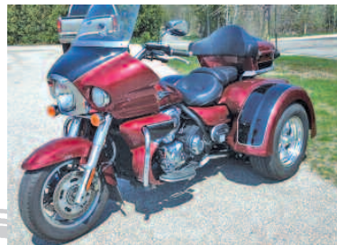
2010 VULCAN VOYAGER MOTOR TRIKE 1,700cc, independent susp, reverse, ABS, cruise, 8,000 miles... $22,900