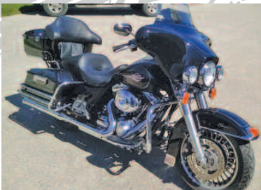
2009 ELECTRA GLIDE CLASSIC 96", 6 speed, cruise, CD, 18,000 miles... $12,900