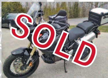
2012 SUPER TENERE 1200 1,200cc, ABS, TCS, Yamaha box & bag, 2,500 miles... $9,900