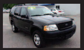
2005 Ford Explorer