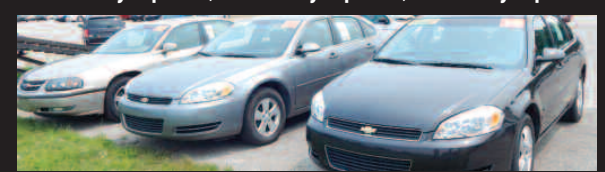
2008 Chevy Impala LT, 2007 Chevy Impala LS, 2003 Chevy Impala LS