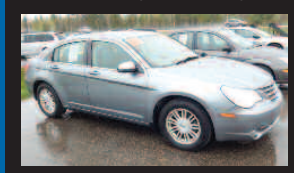
2007 Chrysler Sebring