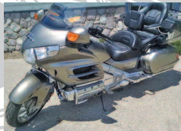
2008 HONDA GOLD WING 1,800cc 6 cyl, reverse, cruise, 18,000 miles... $12,500