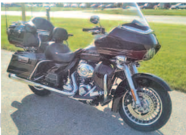
2011 ROAD GLIDE ULTRA 103", Mamba reverse, ABS, cruise, loaded, 5,000 miles... $18,900