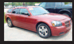
2005 Dodge Magnum