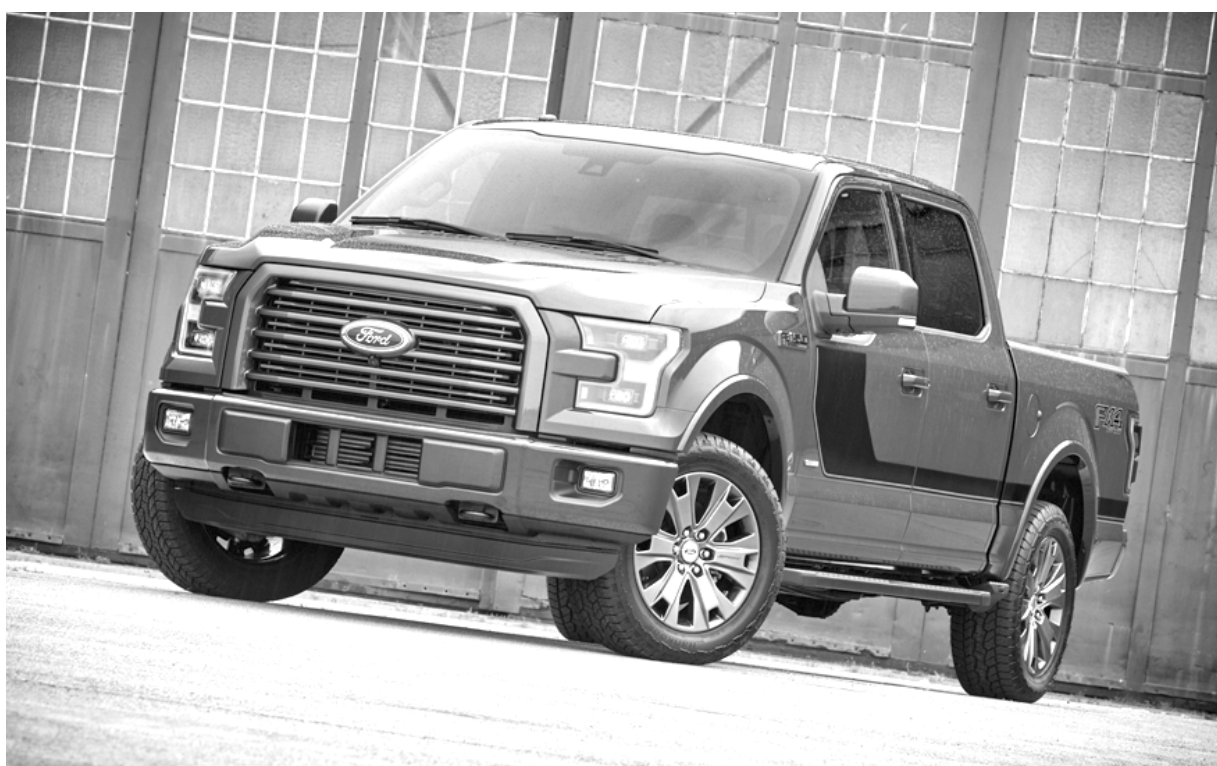
The 2016 Ford F-150, part of Ford F-Series, America's best-selling truck for 38 years, continues to innovate with the addition of breakthrough towing technology, new Special Edition Appearance Packages, SYNC 3 and alternative fuel capability.