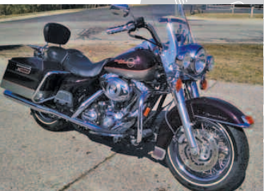
2007 ROAD KING 96", 6 speed, Vance & Hines, new tires, 15,000 miles... $10,900