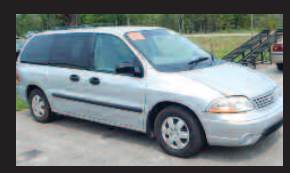
2002 Ford Windstar