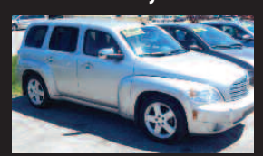
2006 Chevy HHR