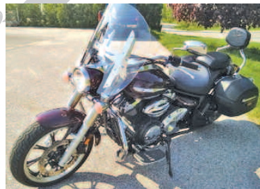
2009 V STAR 950 TOURER 950cc, fuel inj, fact bags & windshield, 1,300 miles... $5,500

PETOSKEY, MI • 231-348-5838 us31sales.com