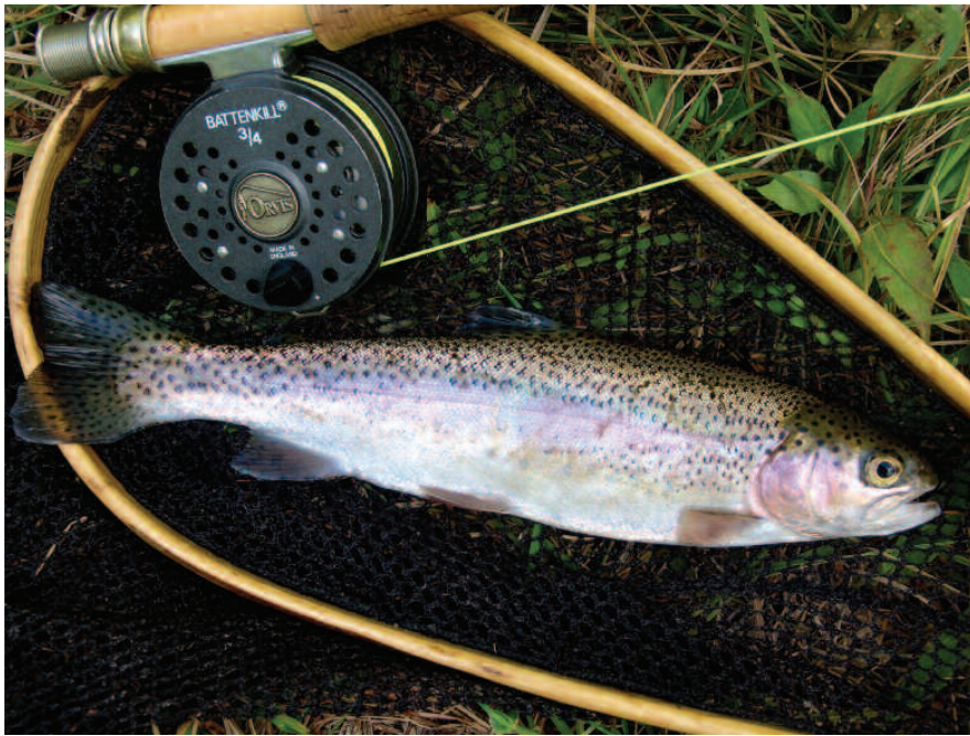
Anglers are concerned that a new fish farm on the Au Sable may threaten trout like this main branch rainbow.

Of primary concern is the contamination of the river that would accompany the 8.5 million gallons of water discharged into the Au Sable each day. This would include an estimated 75,000 pounds of concentrated fish feces per year and, with such contamination, the distinct possibility of the propagation of the microorganism that causes the deadly whirling disease in river fishes. This protozoan is already endemic to the Au Sable and opponents fear that the hatchery may cause it to flourish with devastating effects on wild trout populations. In addition, the increased phosphorous