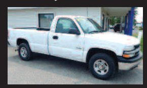
2002 Chevy Silverado 1500, 4x4