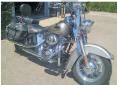
2009 HERITAGE SOFTAIL CLASSIC 96", 6 speed, eng guards, tall w/s, 12,000 miles... $10,900